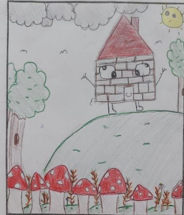
The house stood on the hill