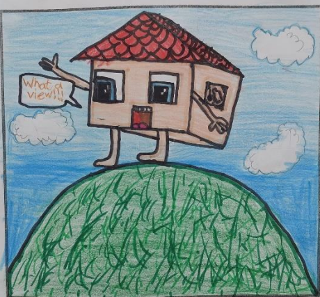
The house stood on the hill