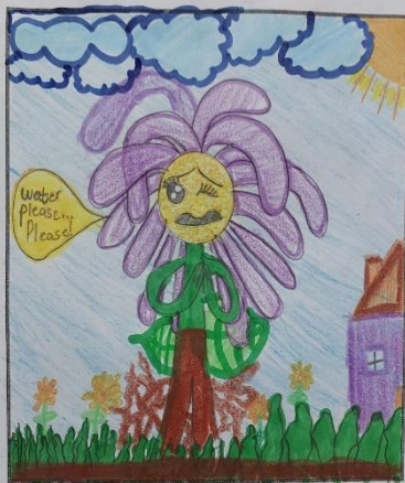
The flower begged for water