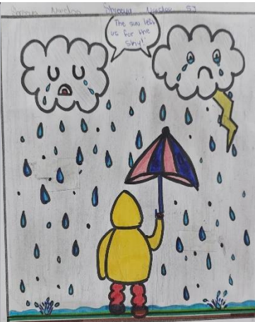
The clouds cried big drops of rain