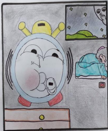
My alarm clocked screamed at me

IPS Bright Sparks: Our Grade 5 learners displayed their creativity during an English lesson.