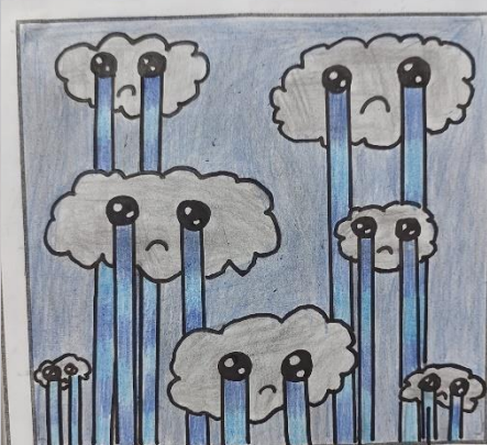
The clouds cried and cried