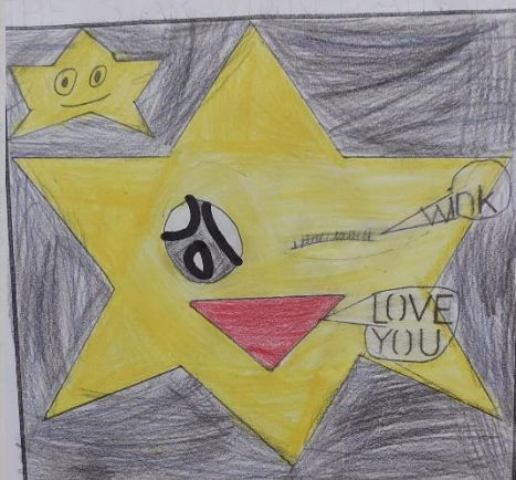
The stars winked in the night sky